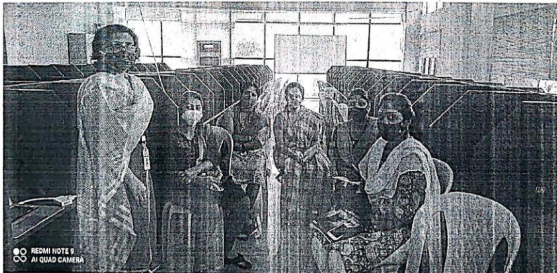
Faculty Members of BCA Dept.