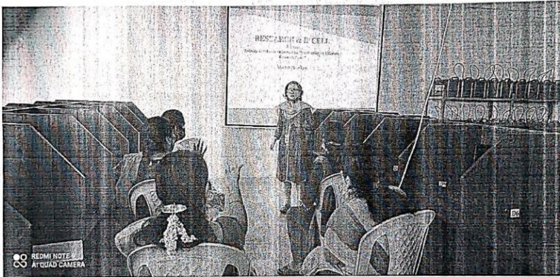
Discussion Exchange Views